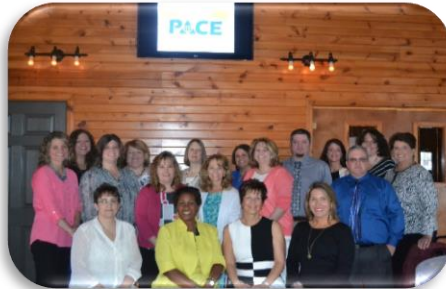
Pace Management Team Carrying the Torch! 50 years of Community Action Celebration.