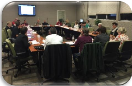
Pace Board of Directors Volunteers from four counties meet to make decisions. They evaluate business matters and needs within the communities.

Serving Daviess, Greene, Knox & Sullivan Counties (limited service in Vigo County)